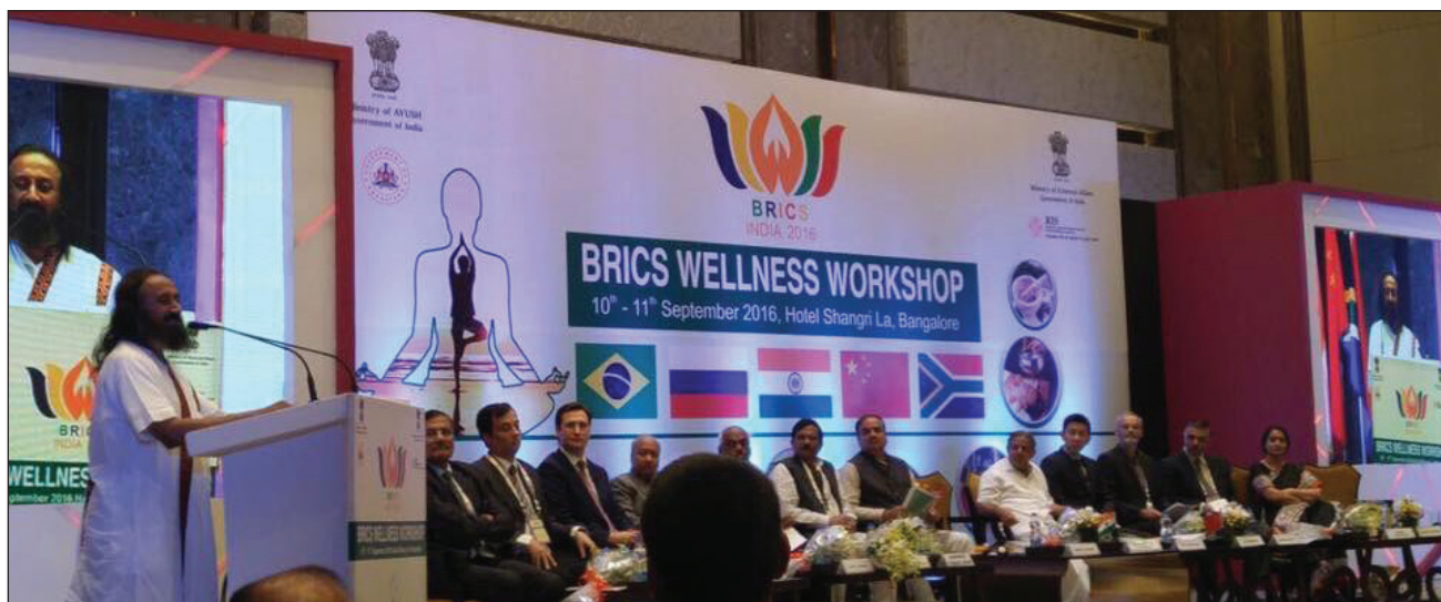
Sri Sri Ravi Shankar speaking at the BRICS Wellness Workshop.