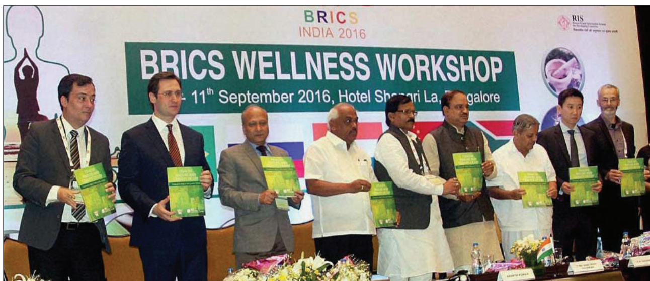
Shri Ananth Kumar, Hon'ble Minister of Chemicals and Fertilisers, Government of India; Shri Shripad Yesso Naik, Hon'ble Minister of State (Independent Charge) for AYUSH; and Shri K. R. Ramesh Kumar, Hon'ble Minister of Health and Family Welfare, Government of Karnataka along with members of BRICS countries releasing the RIS Volume, 'Health, Nature and Quality of Life: Towards BRICS Wellness Index' during the inaugural session of the BRICS Wellness Workshop in Bengaluru.

In the run-up to the BRICS Summit, the BRICS Wellness Forum was organised by the Ministry of AYUSH in partnership with the Ministry of External Affairs and RIS in Bengaluru on 10-11 September 2016 to promote partnership in traditional medicine systems. The Government of Karnataka was the host.