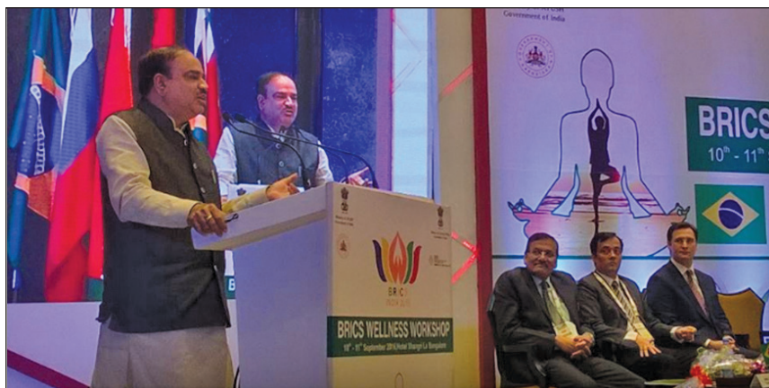
Shri Ananth Kumar, Hon'ble Minister of Chemicals and Fertilisers, Government of India delivering inaugural address at the BRICS Wellness Workshop.