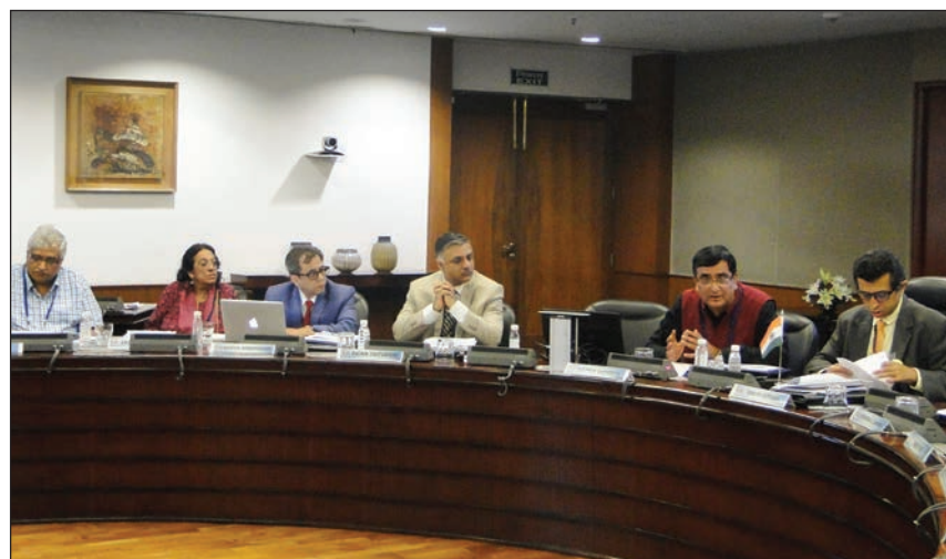
Participants at the Meeting of DPAs/Equivalent of BRICS Member States.