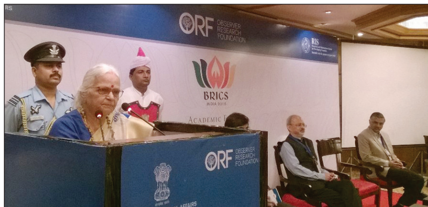
Hon'ble Governor of Goa Smt. Mridula Sinha delivering the valedictory address.

Talking about SDGs, she said that no nation can make sustainable progress without women's participation and when women are given the right educational opportunities, they become more committed to setting goals and achieving them.